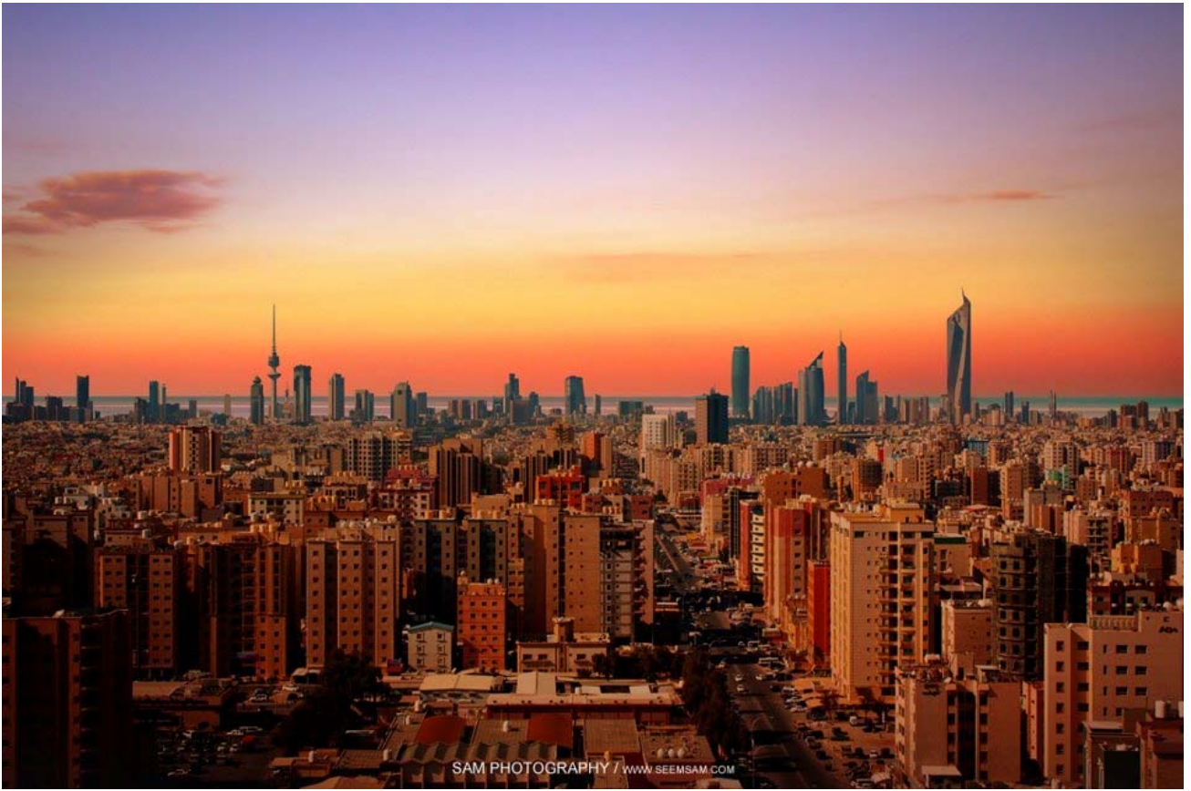
*** From Borrowed Lens.... Kuwait City 2011 ***